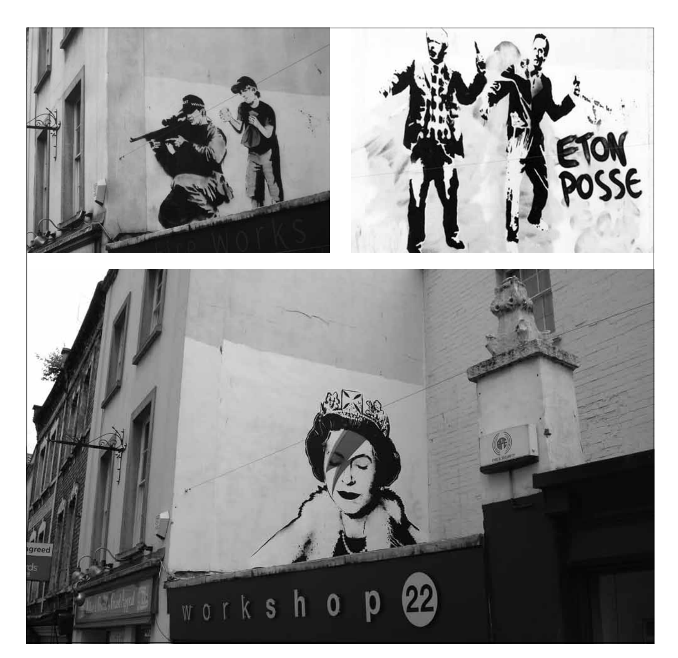
Figures \ 3a-3c \ The \ changing \ face \ of \ a \ gable-end \ wall: from \ Banksy's \ sniper \ to \ A \ Queenin \ Sane \ (Bristol)