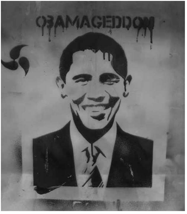
Figure 9. A cynical view of President Obama; stencil made several months after taking office (London)