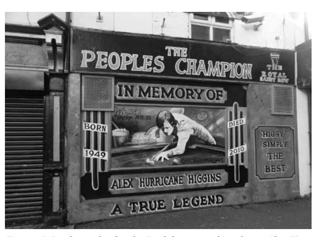
Figure 5. Bridging the divide: Irish hero snooker player Alex Hurricane Higgins, located between the Protestant Catholic Belfast