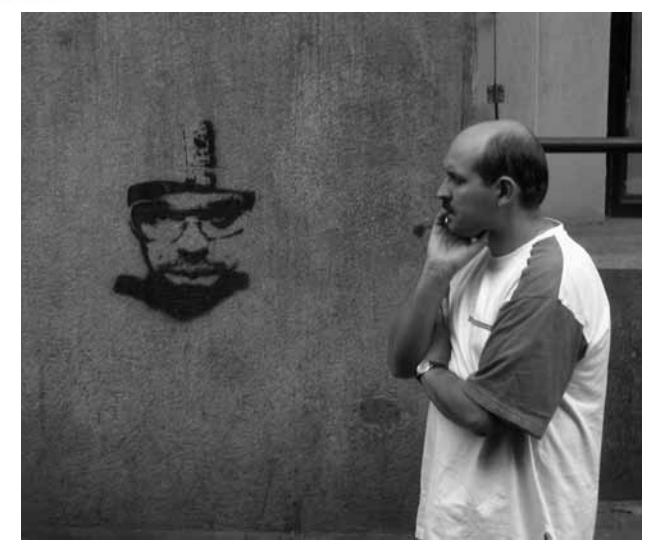
Figure 1. Passer-by pondering a stencil image in Thessaloniki, Greece (2006)