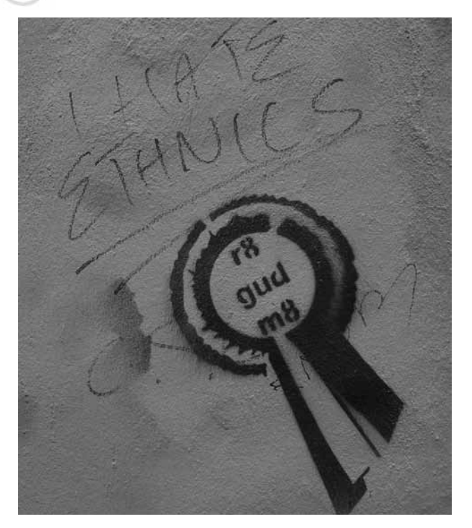
Figure 10. Passive stencil r8 gud m8 [Rate Good Mate!] with 'I hate Ethnics' scrawl above