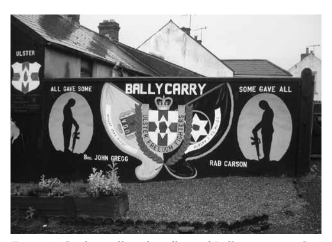
Figure 4. Garden wall in the village of Ballycarry, near Carrikfergus in Northern Ireland commemorating fallen comrades of the illegally-formed Ulster Freedom Fighters