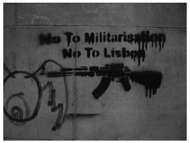
▲ Figure 6. Political statementing saying no to militarisation and no to the [EU] Lisbon Treaty (Dublin)

Figure 7. Contradiction and defiance, potent graffiti on the